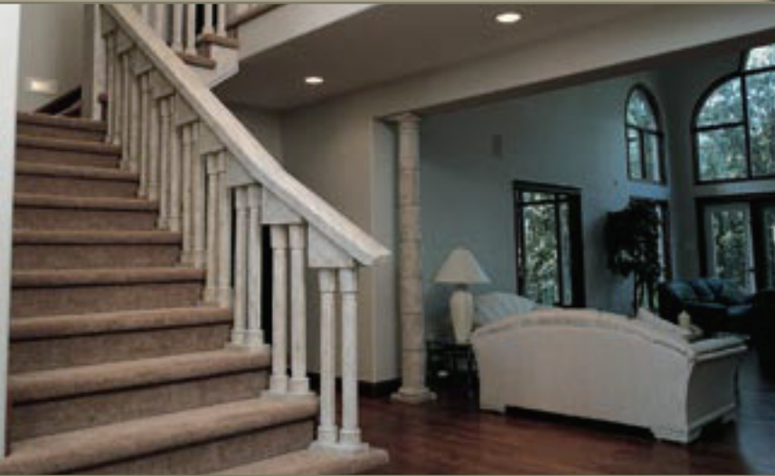
Photo above illustrates the following Spectis products: blocks BL 2470 & BL 2471, baluster BAL 2041-29FS, and rail RAL 2108T-FS top fossil stone texture.