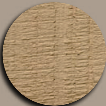
ROUGH SAWN - RS