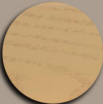
WOOD GRAIN - WG