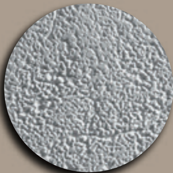
FOSSIL STONE - FS