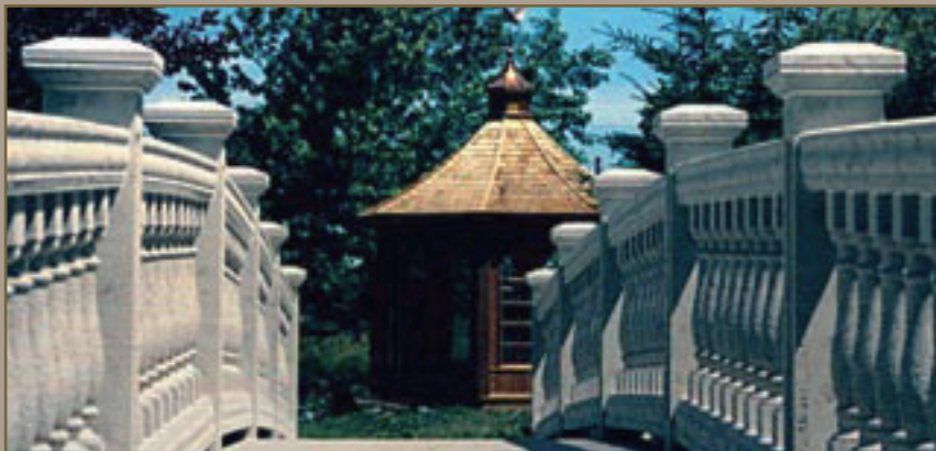
Bridge railing made with baluster BAL 2031FS, rail RAL 2100T-FS & B & newel post NP 2211FS.