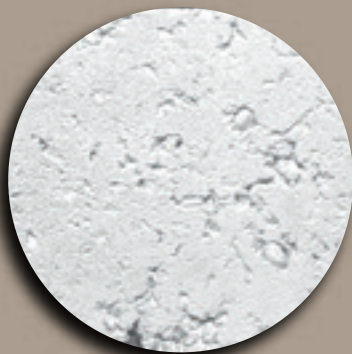
CONCRETE FINISH - CF