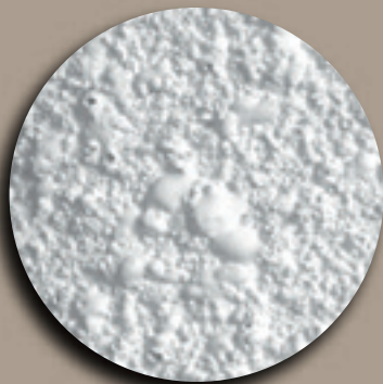
STUCCO STONE - SS