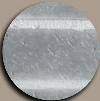
BRICK TEXTURE - BT